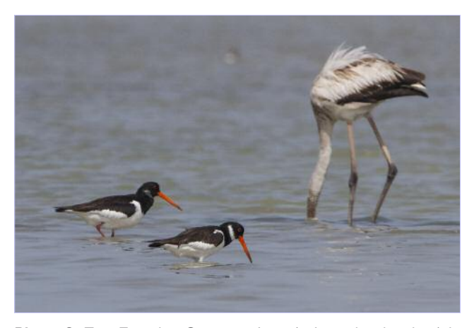
Photo C. Two Eurasian Oystercatchers (subspecies longipes ) in winter plumage feeding on the intertidal flats of Barr al Hikman, Oman, during the falling tide on 25 March 2012.

Summing the site averages of the most recent 10 years in the period 1990-2012 from the IWC database gives a total of 16,000 oystercatchers in their winter range (Table 1, page 45). However this is an underestimate of the real number present because in most countries not all sites are counted or sites are not counted completely. While 127 oystercatchers were counted in Egypt, a total of 1000 was estimated to be present (Meininger & Atta 1994). While the sum of the site averages from 2002–2012 was more than 6,000 in Iran, in January 2009 the most complete count of the Persian Gulf revealed that 8,700 oystercatchers were present with an estimated total of 10,000 (Amini & van Roomen 2009). In Oman, the average number was almost 3,000 birds, but a simultaneous count of Barr al Hikman, Masirah Island and the remaining non-estuarine coastline resulted in a total of 5,500 oystercatchers (Green & Harrison 2008, Klaassen & de Fouw 2008). Also for Pakistan and India it seems likely that total numbers are larger than