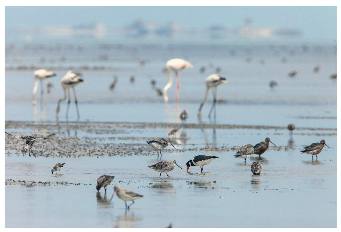
Photo D. An Eurasian Oystercatcher (subspecies longipes) feeding on the intertidal flats of Barr al Hikman, Oman, surrounded by Bar-tailed Godwits on 22 March 2012.