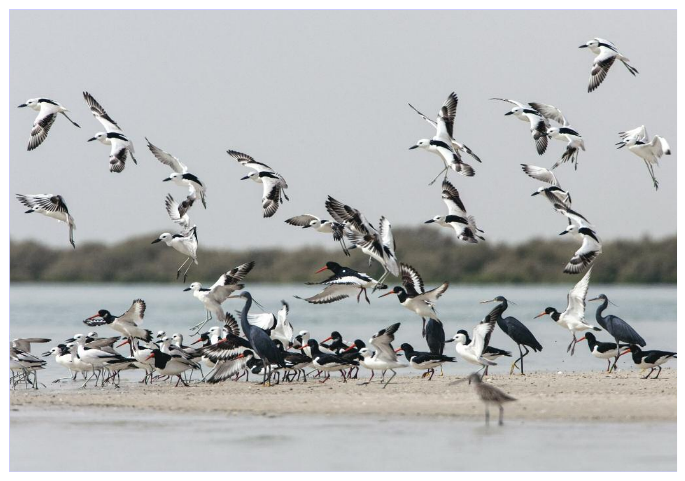
Photo B. Adult Eurasian Oystercatcher belonging to the subspecies longipes on the intertidal flats of Barr al Hikman, Oman, 14 March 2012.