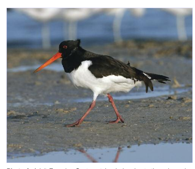
Photo A. Adult Eurasian Oystercatcher belonging to the subspecies longipes on the intertidal flats of Barr al Hikman, Oman, 14 March 2012 (photo: Jan van de Kam).

size of longipes (including buturlini ) on the basis of January numbers during the non-breeding season. Oystercatchers are concentrated in coastal wetlands outside the breeding season and there they can be counted relatively easily [Photo B].