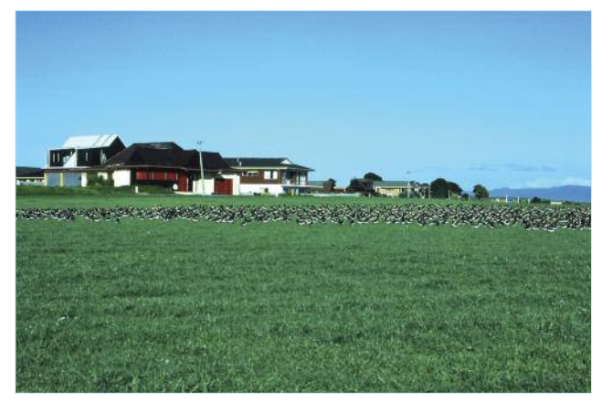
Photo D. Roost of South Island Oystercatchers at Kiwi Esplanade, Manukau Harbour, New Zealand.

The total population in 1970/71 was estimated at 49,000 birds (Baker 1973). However, numbers increased subsequently and national wader counts from 1983 to 1994 resulted in an estimated South Island Oystercatcher population size of 112,675 birds (Sagar et al. 1999). Continuing counts have not been as comprehensive, but during the period 1994–2003 numbers increased at some sites and declined at others (Southey 2009). Counts on the Manukau Harbour and Firth of Thames (OSNZ data) suggest that the total may have