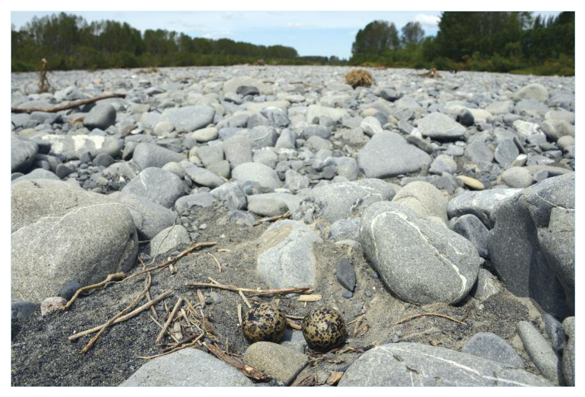
Photo B. Nest of South Island Oystercatcher in the bed of a braided river in New Zealand.

Non-breeding South Island Oystercatchers are spread throughout the coastal regions of New Zealand with two thirds of the population (68%) found in the northern half of the North Island. The Nelson region is also significant as a nonbreeding area for about 18% of the population (14,000 birds, Schuckard 2002). The Avon-Heathcote Estuary supports several thousand birds, and Otago Harbour 1,000–2,000; most other estuarine habitats have populations varying from