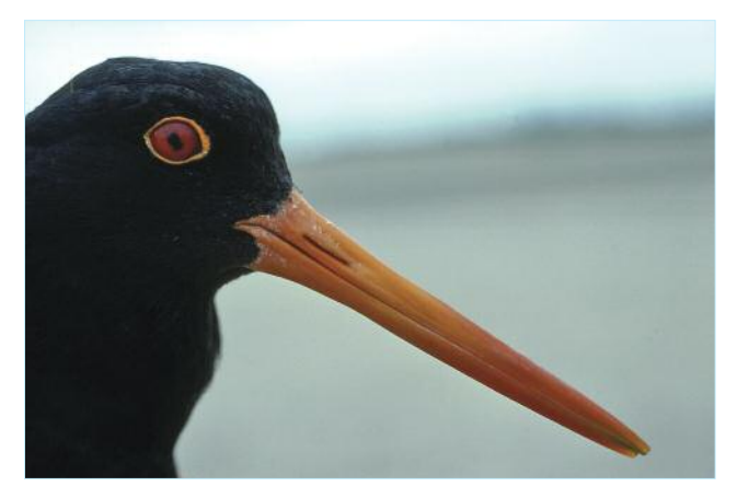
Photo A. Close-up of the head of an adult South Island Oystercatcher.

Breeding used to be confined to gravel riverbeds [Photo B], but since about 1950 it has spread onto arable land and onto high-country tussock grasslands (Baker 1974a). Nests are generally unlined scrapes on a mound or raised area of sand, gravel or soil with good visibility (Sagar et al. 2000). Some pairs breed on coastal beaches where their breeding timetable and habitat overlaps that of Variable Oyster-catchers ( H. unicolor ); apparently this has resulted in hybridization at one location (Crocker et al. 2010).