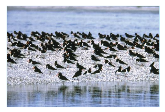
Photo C. Roosting South Island Oystercatchers at Karaka, New Zealand.

hundreds down to occasional winter sightings (Sagar et al. 1999). [Photo C.]