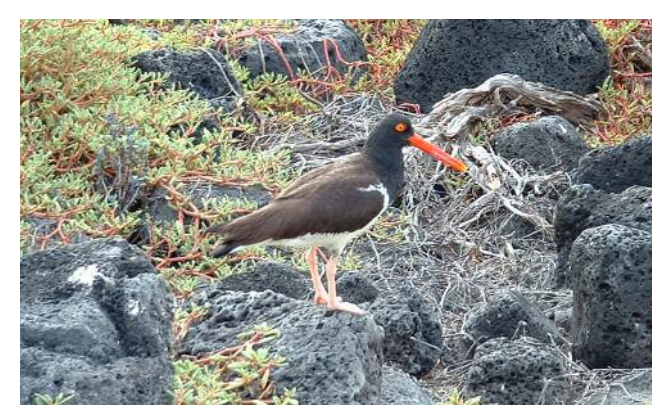
Photo G. Adult American Oystercatcher ssp. galapagensis on the Galapagos.

The current global population estimate is based largely on extrapolation from a few surveys that rarely have specifically targeted H. palliatus . To date, there has been no systematic effort to census the global population or even regional populations (apart from that in the United States, and a recently