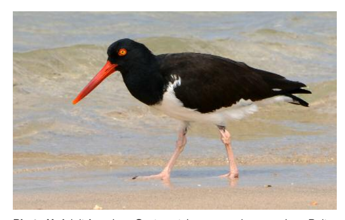
Photo H. Adult American Oystercatcher ssp. galapagensis on Baltra Island, Galapagos, July 2013.