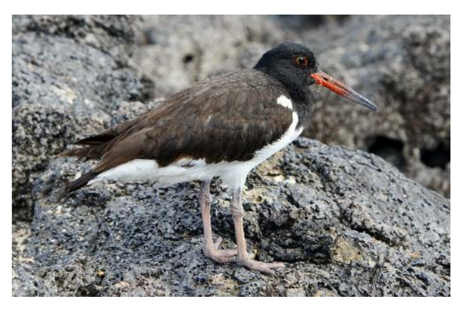
Photo I. Juvenile American Oystercatcher ssp. galapagensis on San Cristobal Island, Galapagos, July 2013.

started initiative in Chile) in a standardized fashion. Consequently, it is impossible to conduct a meaningful trend analysis for any region of the species' range or population. Although more reliable global abundance estimates and the ability to monitor trends in population size are desirable, an intensive rangewide survey would require tremendous effort and expense. Instead, there are some clear priority geographic areas for which standardized data on distribution and abundance are particularly important. These include: