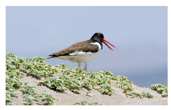
Photo E. Adult American Oystercatcher ssp. pitanay in Chile.

Oystercatchers are specialized to feed on bivalves and other marine invertebrates (Nol 1989) using their laterally compressed bill to server the adductor muscle that holds the shells together (Nol & Humphrey 1994). Because of this specialized diet, H. palliatus are primarily found in coastal areas that support intertidal shellfish beds, both during the breeding and non-breeding seasons. Recent data from the Atlantic coast of North America suggest a diverse diet (Altman & Sanders in review). In the northern part of range (Massachusetts south to New Jersey) the diet includes blue mussels Mytilus edulis , ribbed mussels Geukensia demissa and Modiolus plicatus , soft-shell clams Mya arenaria , surf