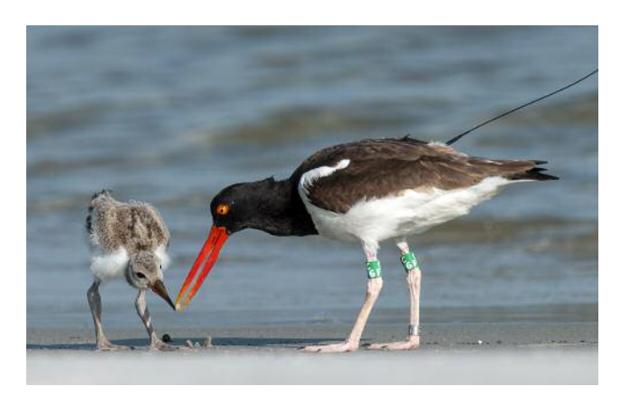
Photo C. Adult American Oystercatcher with metal band, colour bands and transmitter.