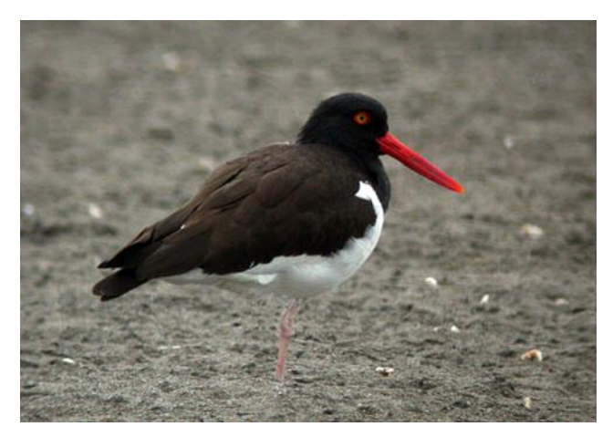
Photo F. Adult American Oystercatcher ssp. pitanay in Peru.

In the Caribbean, the nominate race is a fairly common breeding resident in the central and southern Bahamas, somewhat rarer in the northern Bahamas, a locally fairly